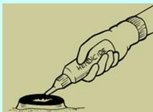
Cut and Paint