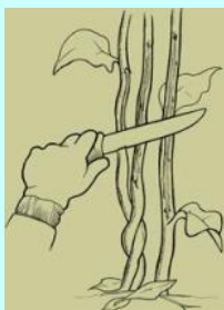
Stem scrape – with blade, scrape stem from base up to 20cm – apply herbicide to entire scrape area.